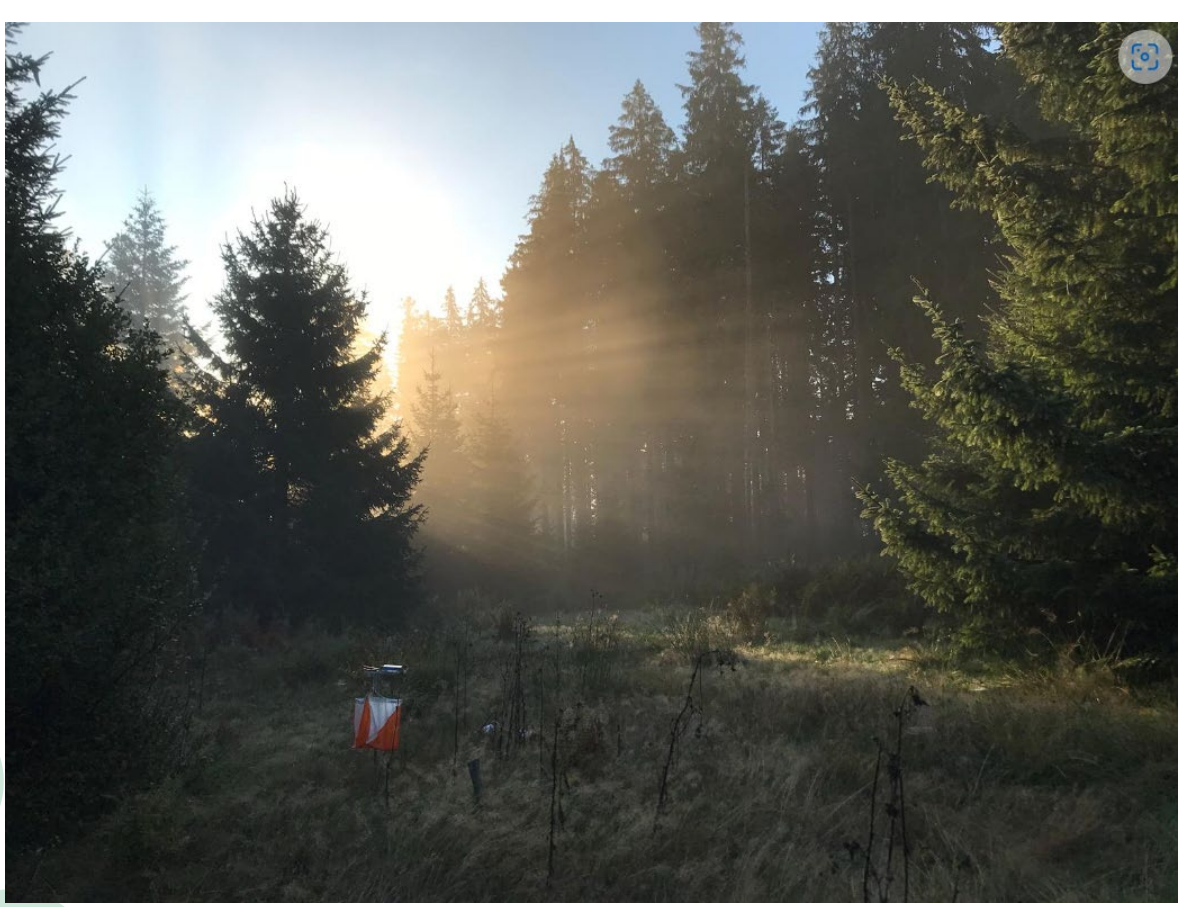
The Hirschberg can boast with a fairytale atmosphere for the middle distance race.

The weekend of the European Student Championships 2023 is also a journey along the historic St. Gallen-Gais-Appenzell Railway (SGA), popularly known as the Gaiserbahn. The middle distance race on Saturday will take place on the northern slope of the Hirschberg above the Kurt village of Gais AR. The already often used orienteering area belongs to the absolutely most beautiful pre-alpine forests of Eastern Switzerland and offers ground vegetation in the form of moss and swamps instead of thorns. Glades and a thousand streams give the forest a special character. On Saturday also the traditional Youth Cup starts, where the best orienteering young talents of Switzerland compete with their junior squads. For the junior squad ZH/SH the aim is to defend the title. For all other orienteering enthusiasts, there is a starting opportunity at the Engelburger OL, which will also be held at the same time.